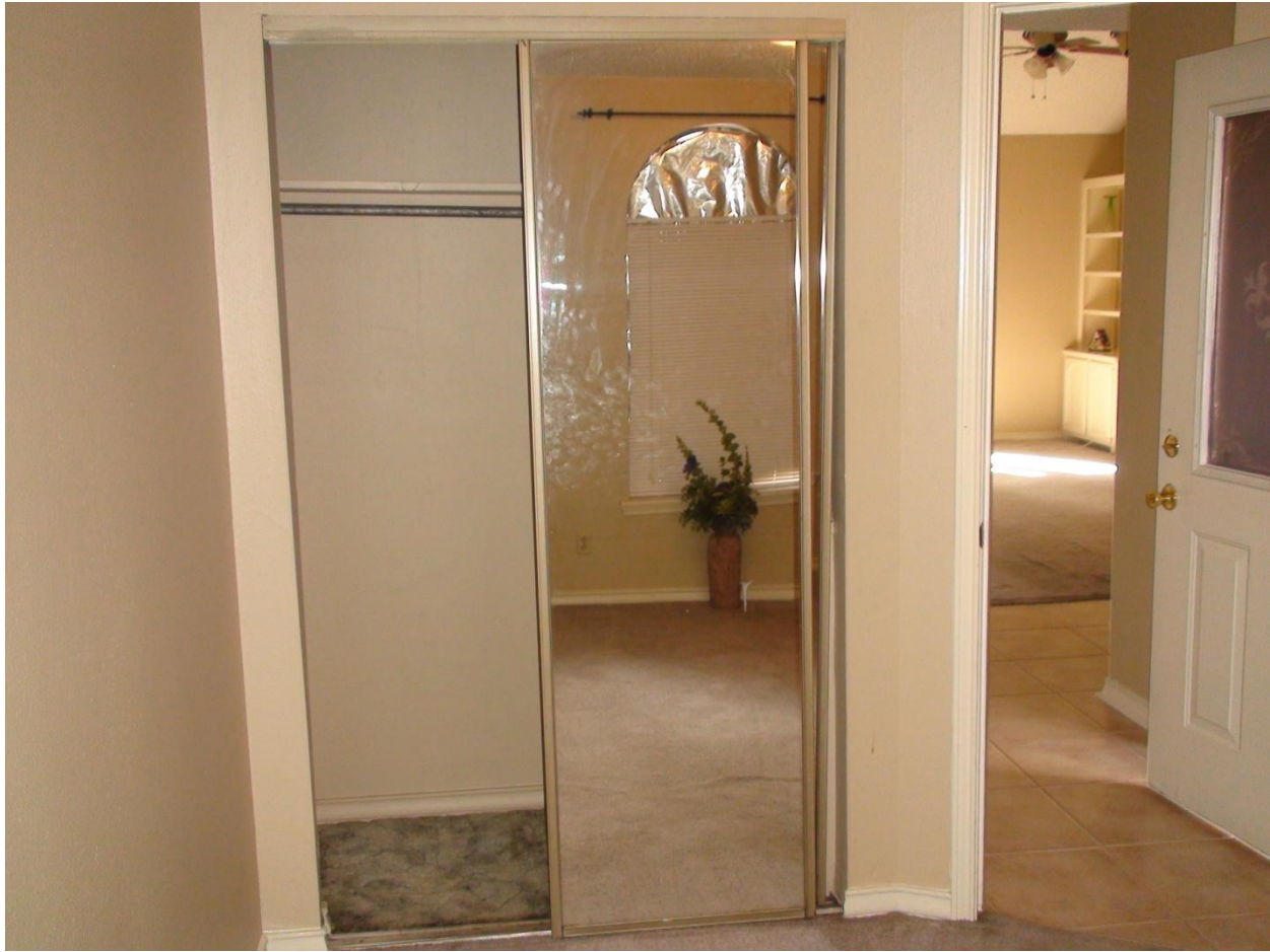
Master bedroom has sliding mirror closet. Side room has Murphy Bed for guest.